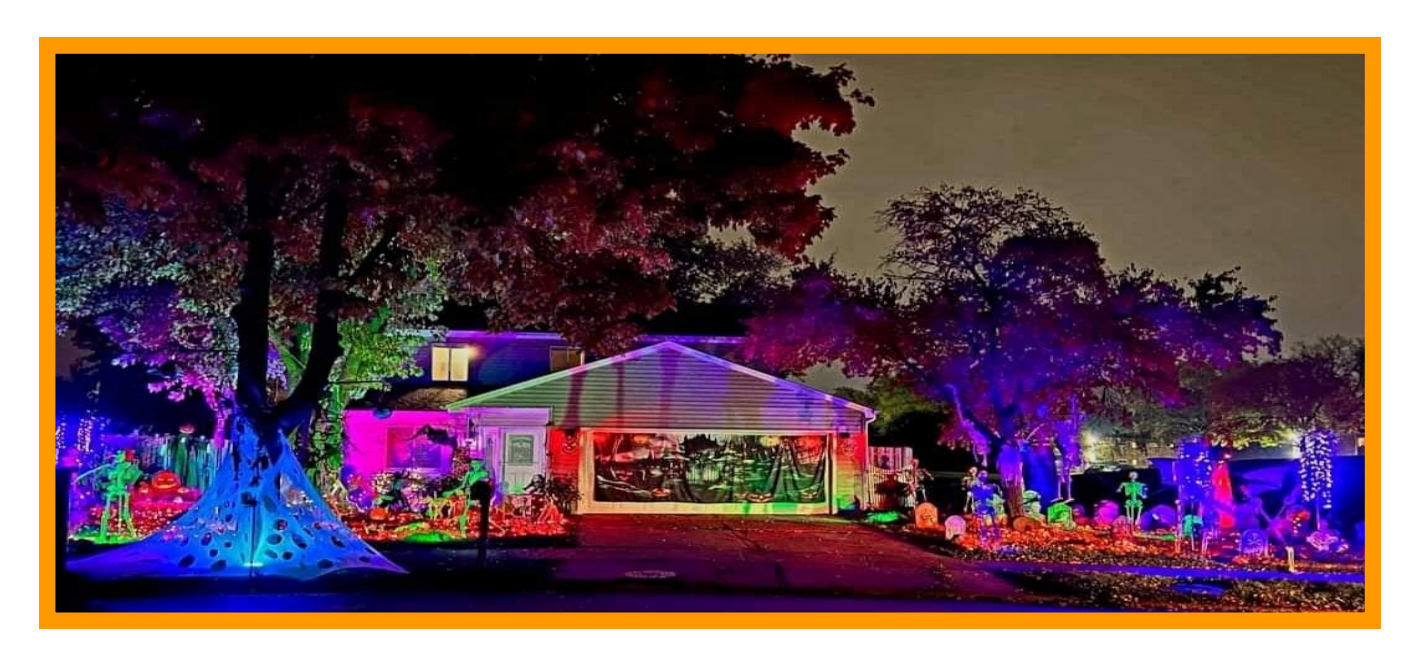
KUDOS to the house on Sova Lane who put a lot of effort into decorating for Halloween. GREAT JOB!

The Board and Staff of Summerlakes wish all of our families a very Happy Holiday! The Clubhouse will be CLOSED on November 23rd and 24th for the Thanksgiving holiday